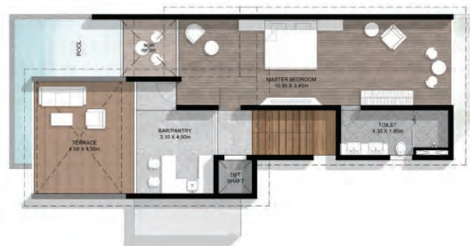
TYPE A – SECOND FLOOR