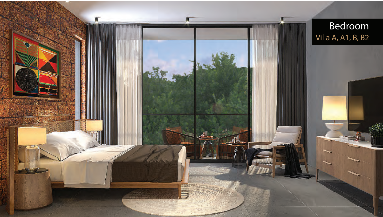
Bedroom Villa A, A1, B, B2