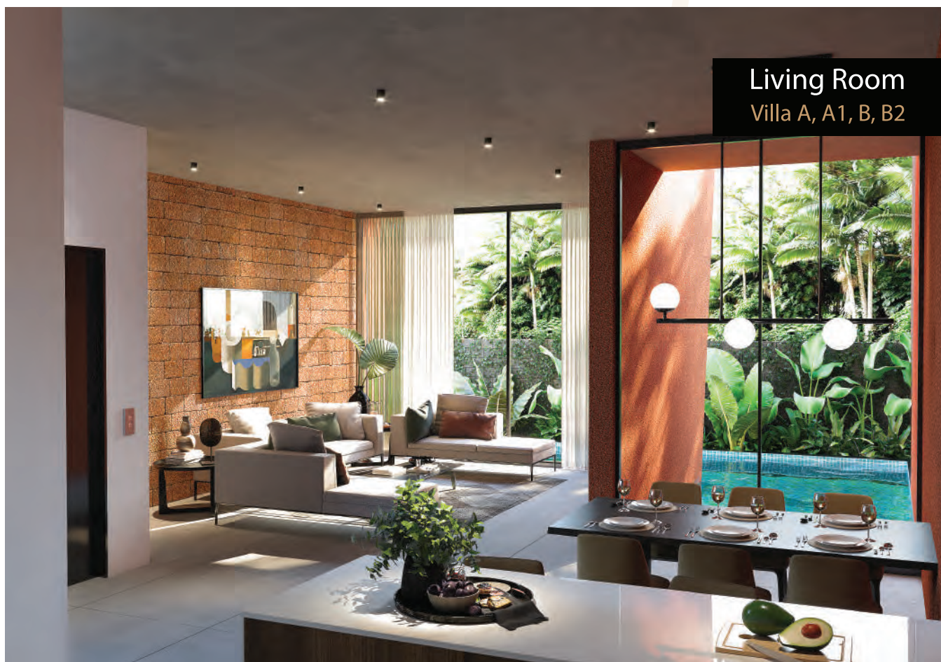
Living Room Villa A, A1, B, B2

Each Triplex Villa features private garden and pool, elevator, 4 large bedrooms with en suite bathroom, balconies, terraces and/or decks (both covered and uncovered) on each floor, luxurious master suite with double vanity bath, powder room, large living and dining room with open-plan kitchen, private car park, floor-to-ceiling windows, exposed brick walls, 100 percent generator backup. Some with open-air "sky bridge" over internal road. Top floor bar & lounge. Built up areas ranging from 260 to 272 square meters, super builtup from 302 to 330 square meters. Fully furnished.