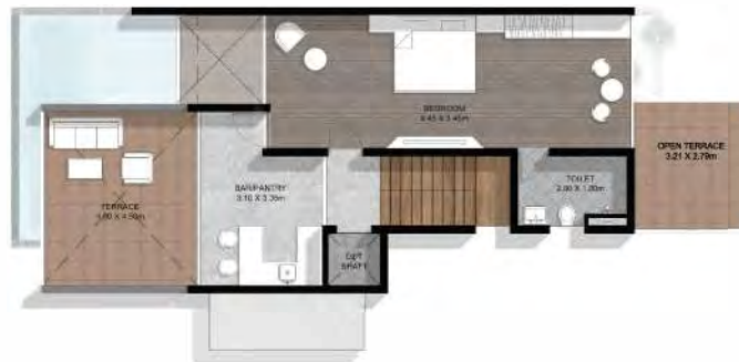
TYPE B – SECOND FLOOR