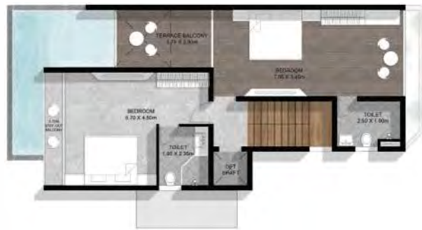
TYPE B – FIRST FLOOR