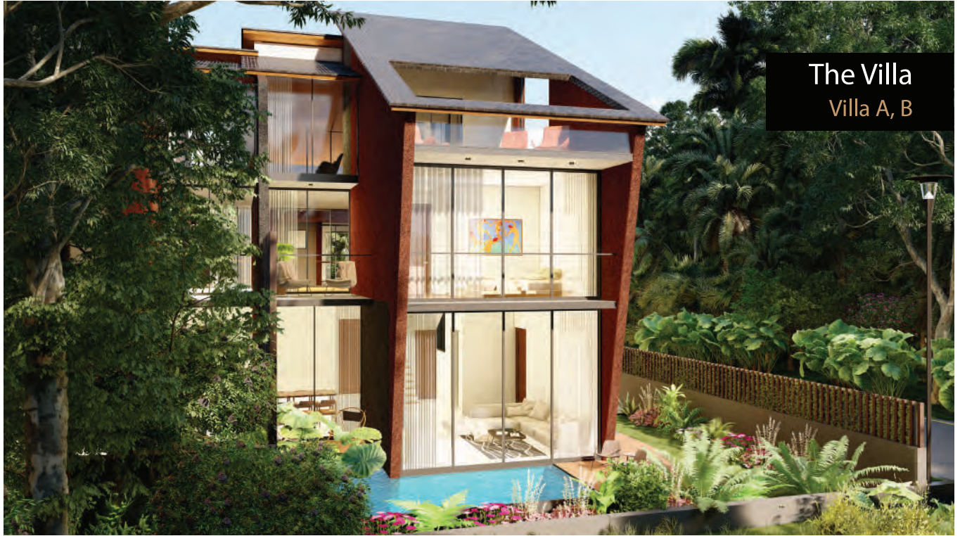
The Villa Villa A, B