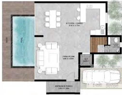
TYPE C – GROUND FLOOR