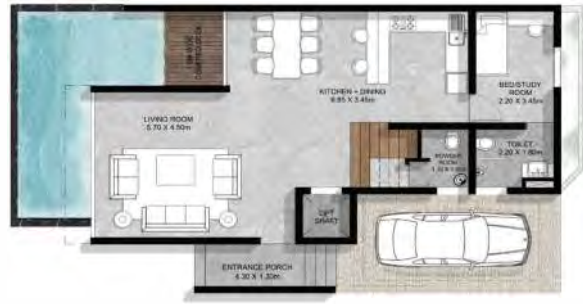
TYPE B – GROUND FLOOR