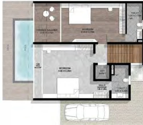
TYPE B1 – FIRST FLOOR