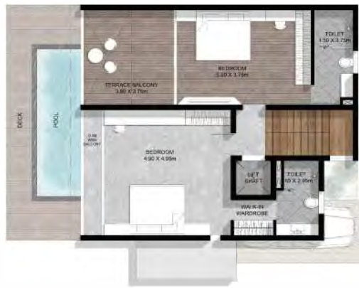
TYPE C – FIRST FLOOR