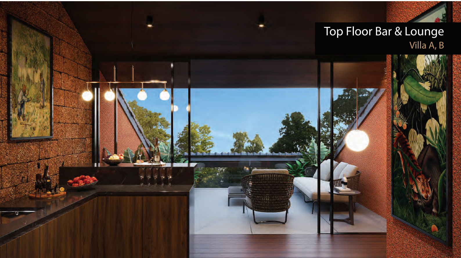
Top Floor Bar & Lounge