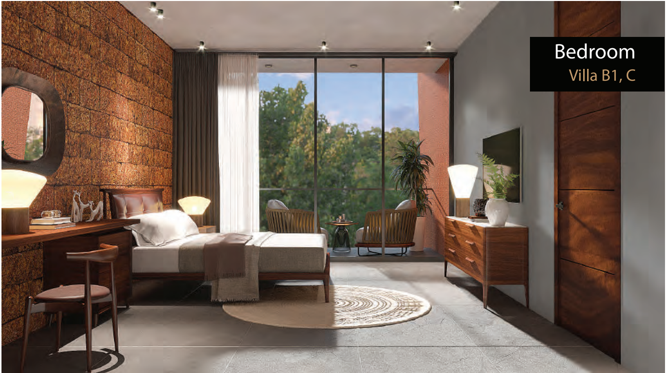
Bedroom Villa B1, C