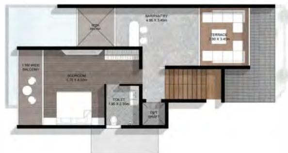
TYPE B2 – SECOND FLOOR