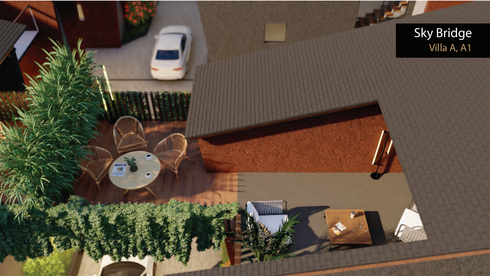
Sky Bridge Villa A, A1