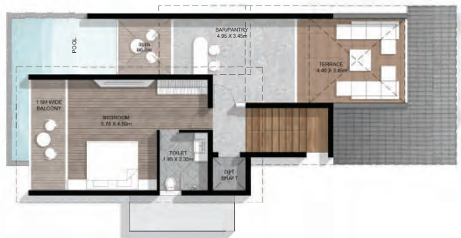
TYPE A1 – SECOND FLOOR