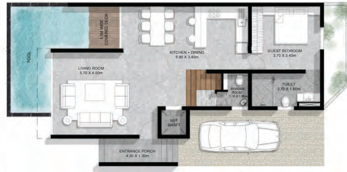
TYPE A – GROUND FLOOR