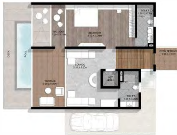
TYPE B1 – SECOND FLOOR