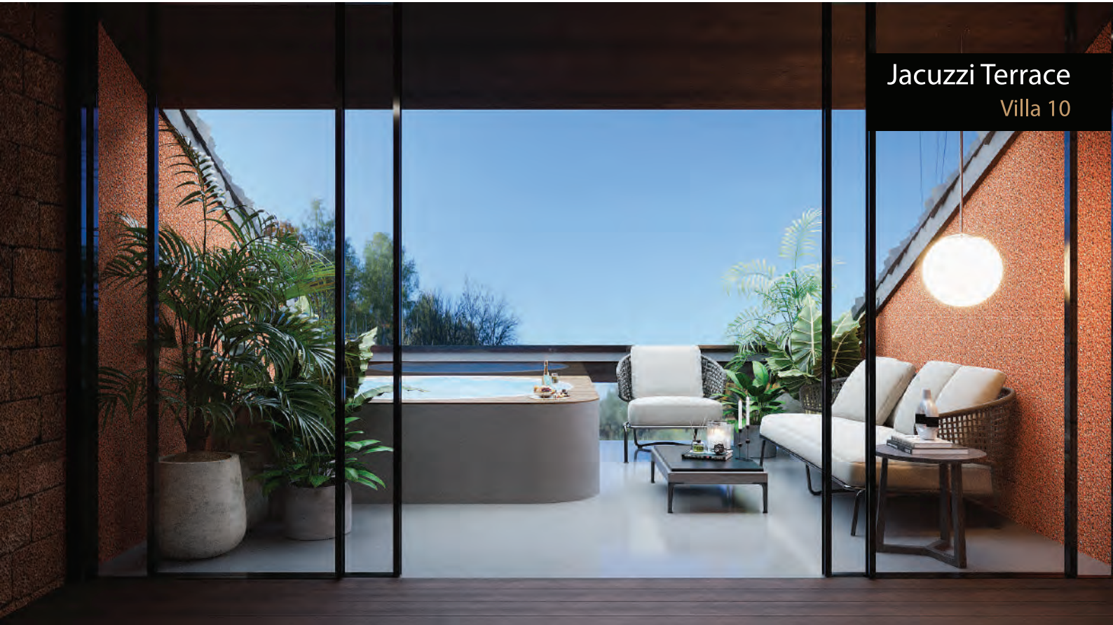
Jacuzzi Terrace Villa 10