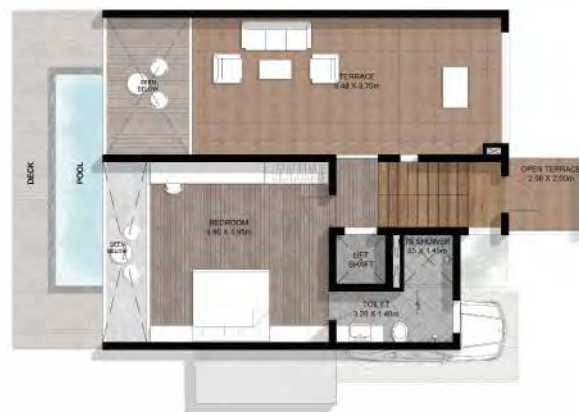
TYPE C – SECOND FLOOR