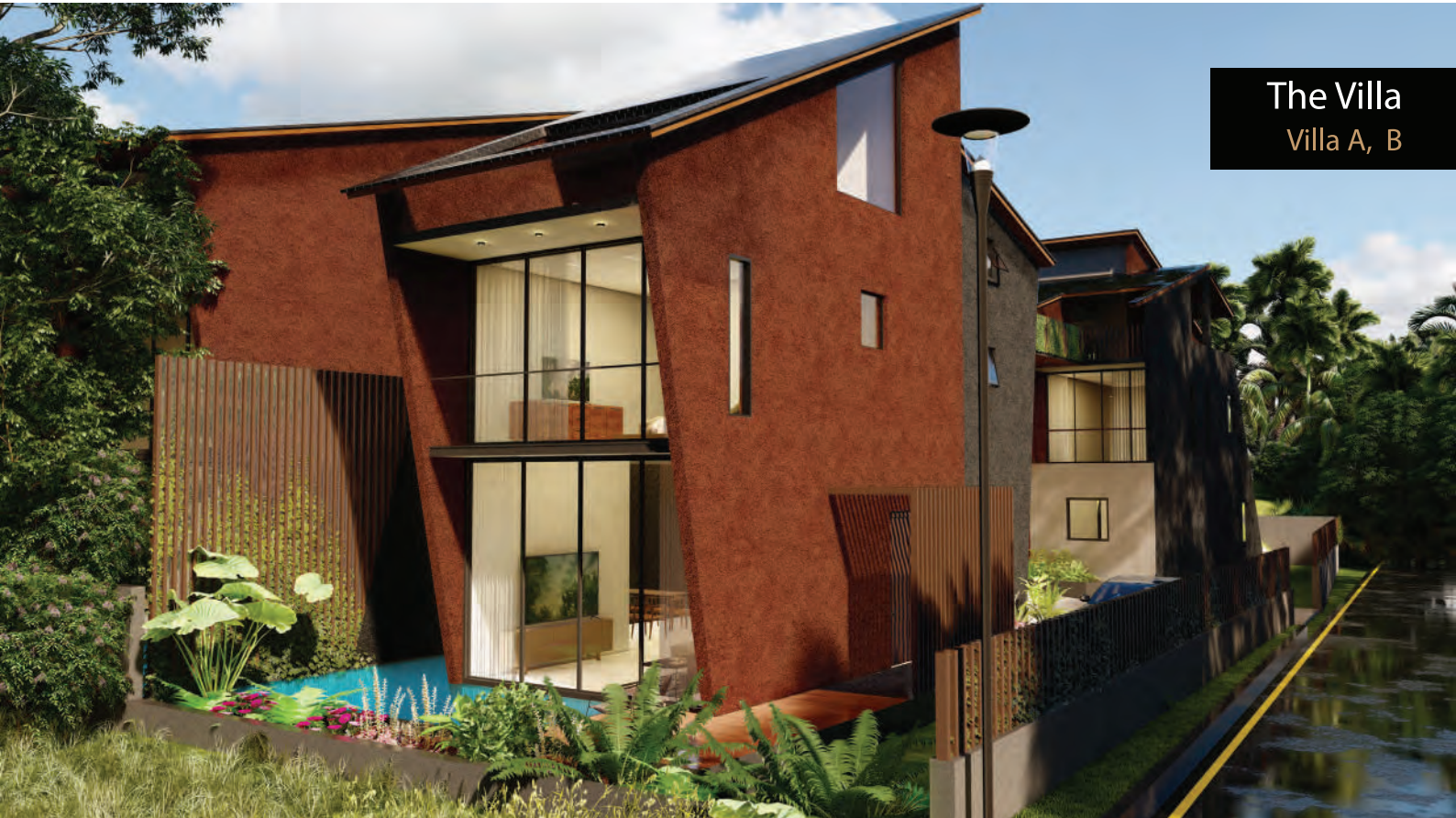
The Villa Villa A, B