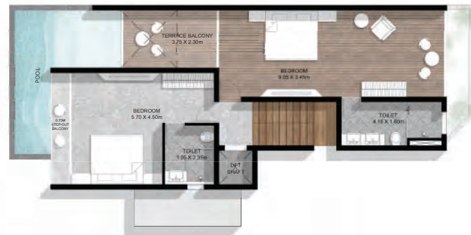
TYPE A – FIRST FLOOR