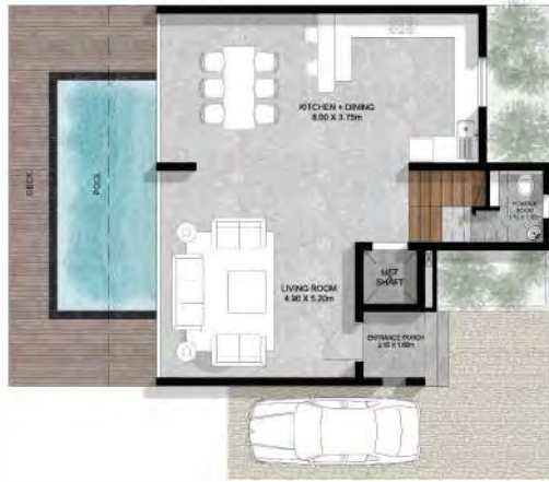
TYPE B1 – GROUND FLOOR