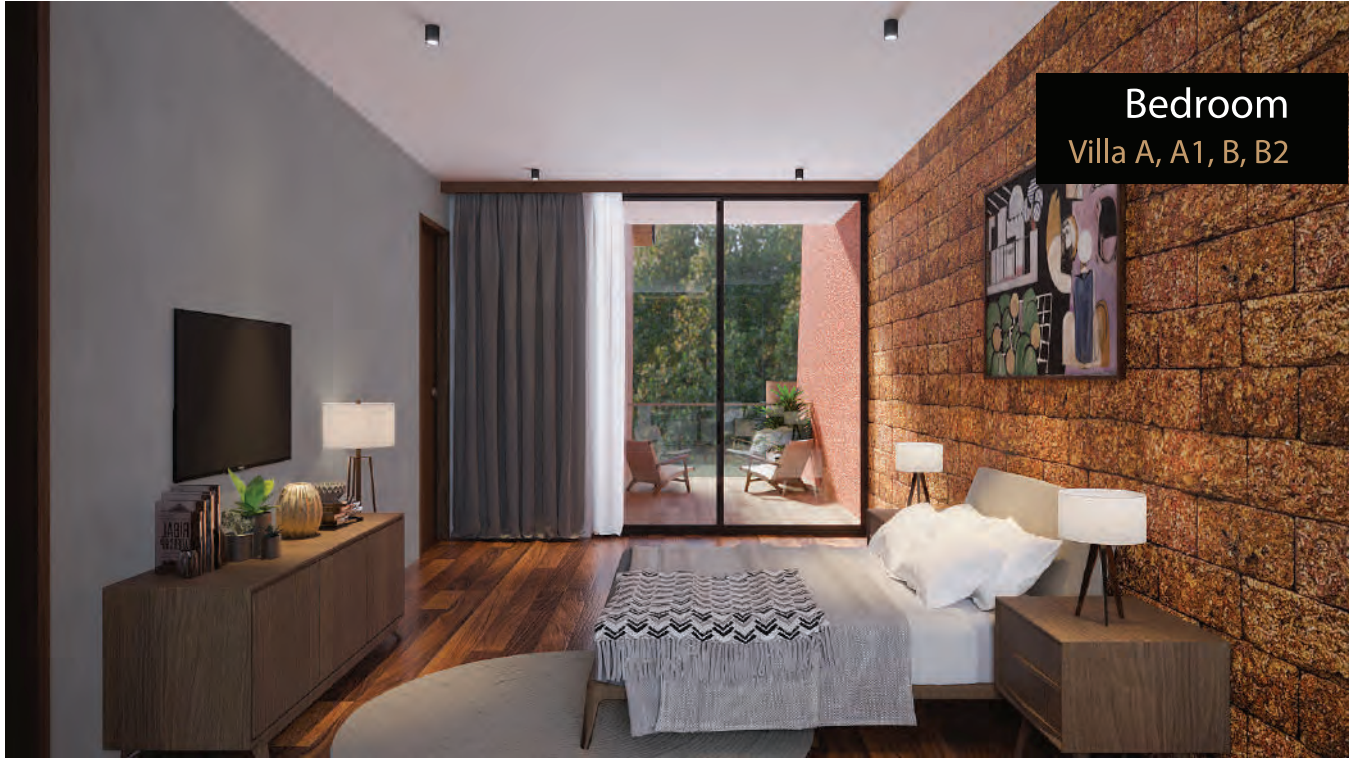
Bedroom Villa A, A1, B, B2