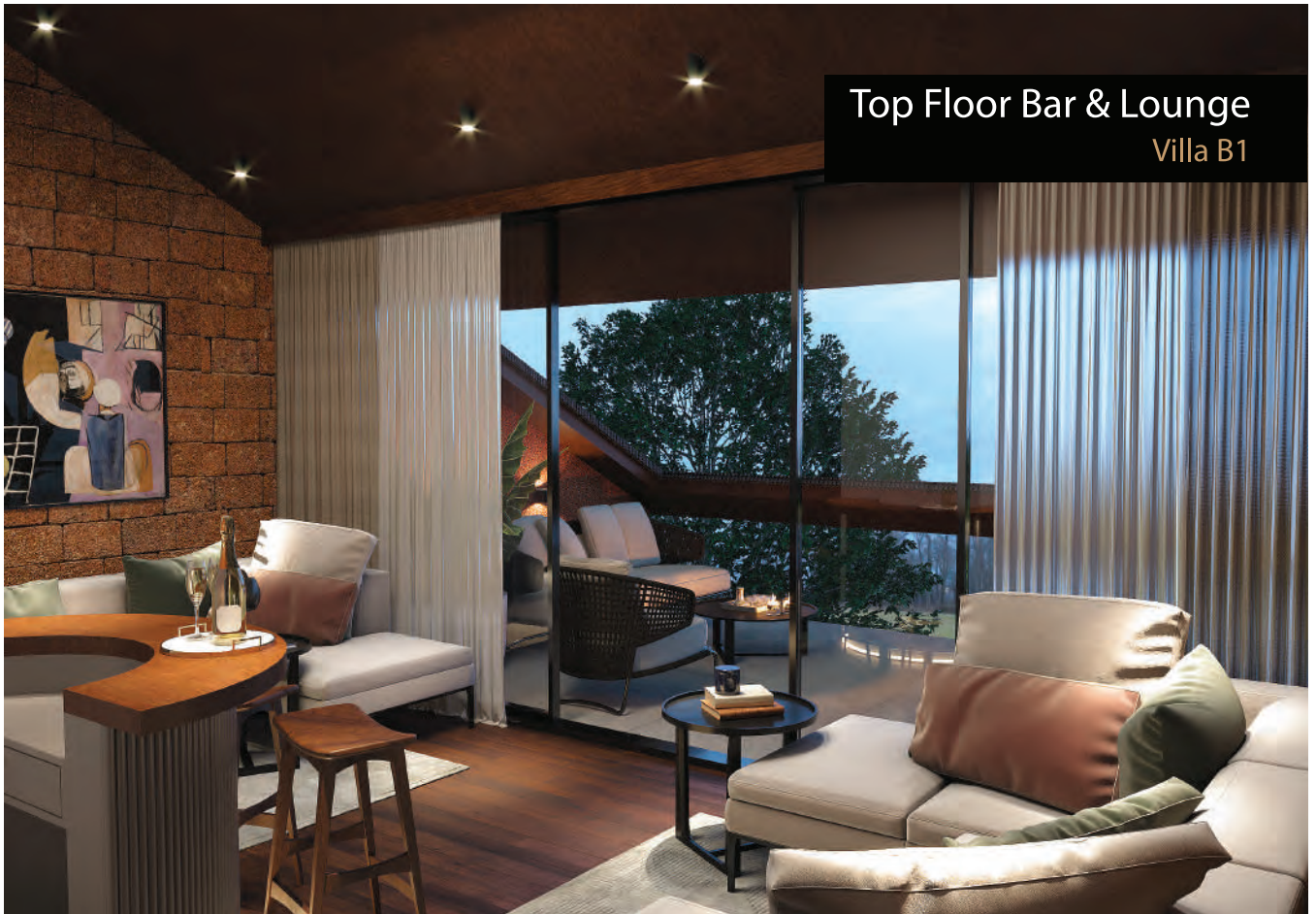
Top Floor Bar & Lounge Villa B1